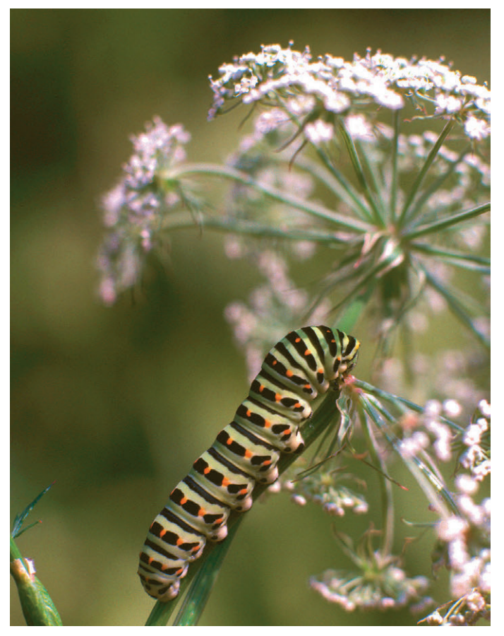
Swallowtail caterpillar on milk-parsley.

cracks open one last time, and a new hard skin appears. This new skin is called a chrysalis, and it hardens into a pupa. And now something peculiar happens. Inside the pupa, the caterpillar dissolves into a kind of soup. Out of that soup, the actual butterfly is formed, with wings and all. The following spring, the butterfly hatches from the pupa and comes out'.