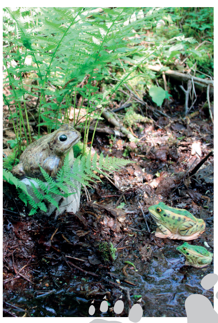
Toad (left) and frogs (right).